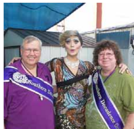
Krewe of Petronius BBQ & Bingo raises $500 for Southern Decadence @ Tulane Ave Bar ~ New Orleans ~ Photos by Guest Photographers, Rip Naquin