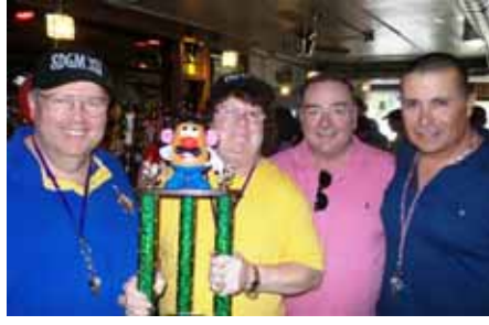
2nd Annual Potato Salad Contest raises $275 for Southern Decadence @ GrandPre's ~ New Orleans ~ Photos by Darwin Reed