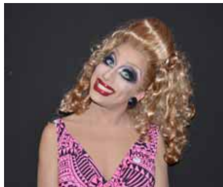
Bianca Del Rio @ Oz

The 51st Annual Bourbon Street Awards show, the ultimate costume contest, is set for Mardi Gras day,