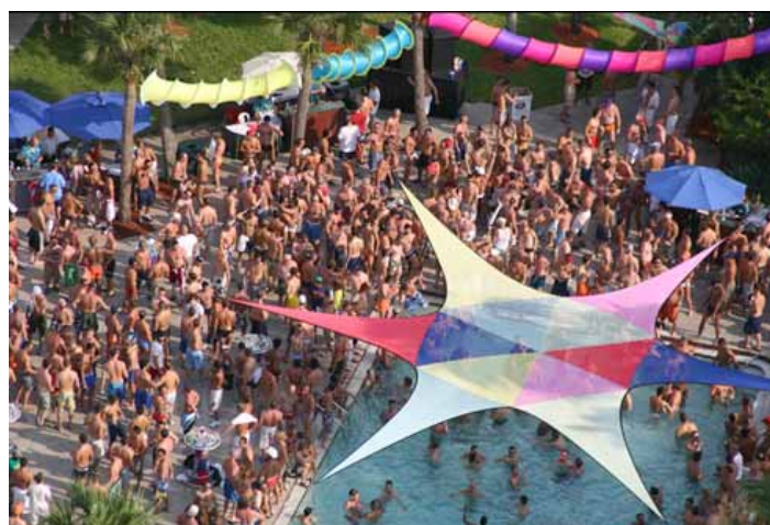
Reunion Pool Party

book your room now and don't miss the chance to "Stay where you Play!" Purchase tickets and find event and hotel information at www.OneMightyWeekend.com . The latest stats can also be found on our One Mighty Weekend Facebook page.