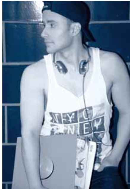
Joe Blue Records

I absolutely hate it! I had a feeling this winter would be bad because the last couple have been relatively mild, but I didn't think it'd be this cold. The only time I see the sun is when I travel somewhere that hasn't succumbed to the polar