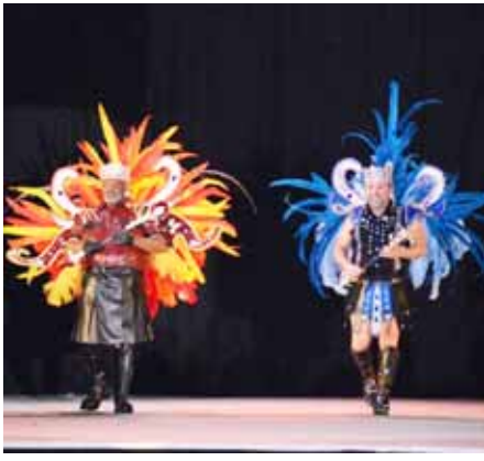
34th Lords of Leather Bal Masque: Magic To Do @ Alario Center ~ Westwego, LA ~