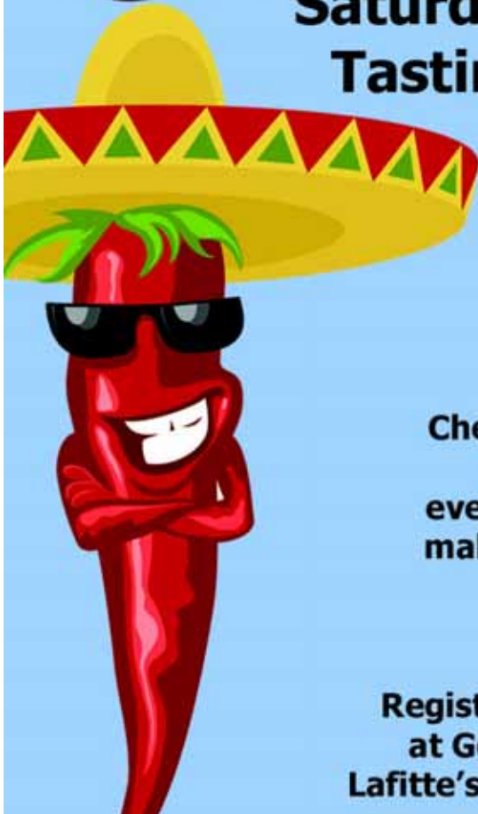
Table Space & Hot Plate provided at each bar

Chefs picks bar and provide everything else making at least 2 gallons