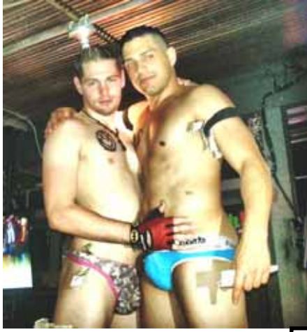
Hot boys dancing on the bar @ B-Bob's