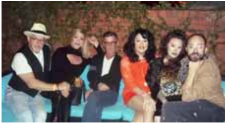
Miss Cie & Friends @ Flip Side Patio Bar